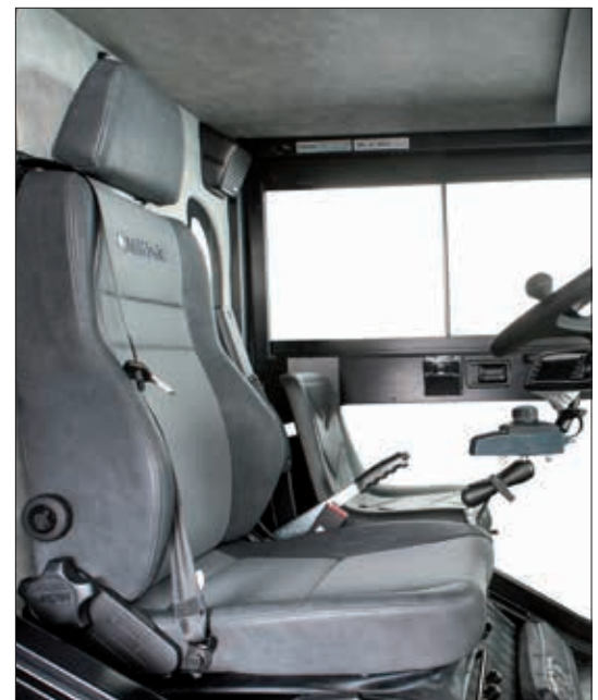
The cab is wide and comfortable enough for two seats