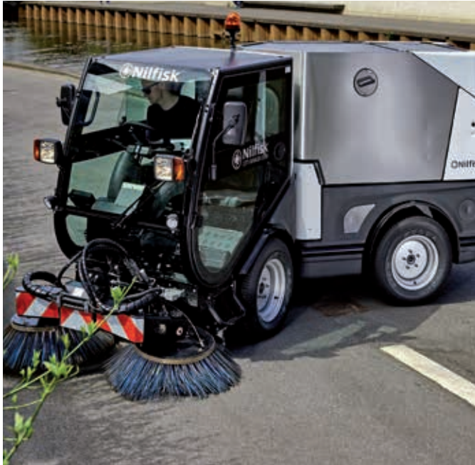
A compact and manoeuvrable all-year machine

The City Ranger 3500 has a strong articulated steering that provides it with great manoeuvrability as well as ensures a steady transport. The small turning circle radius allows it to work in narrow spaces, and as the lowest and slimmest vehicle in this machine class it is even able to enter underground parking facilities. Speed regulation is extremely easy too, due to the hydrostatic drive system.