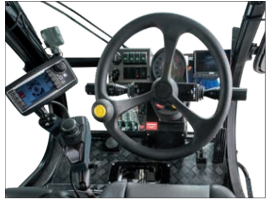
Ergonomically designed workplace