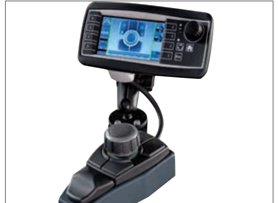
Multifunction joystick with gel pad