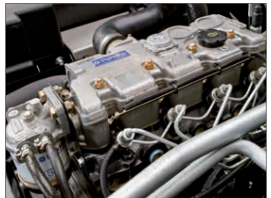
4 cylinder Perkins engine